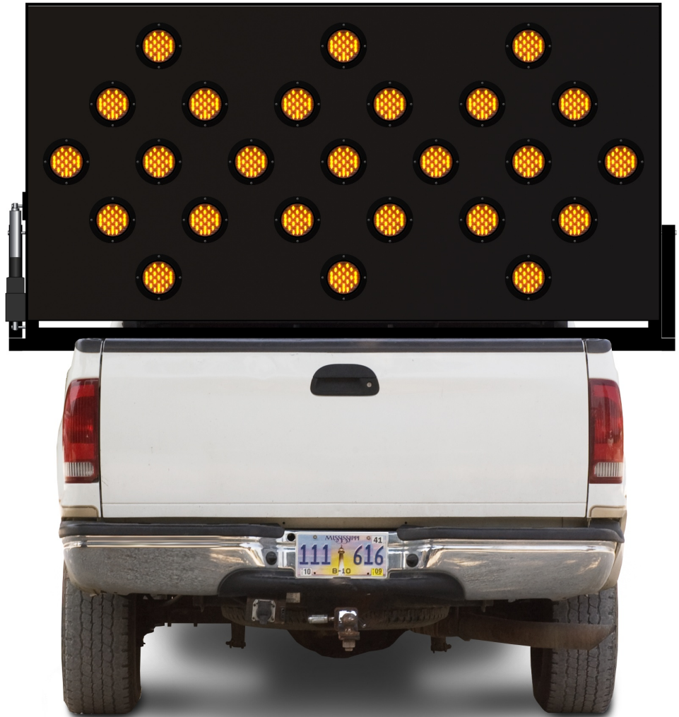
Shown with optional Frame with Actuator